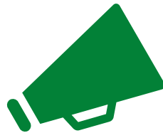
Advocacy and Information