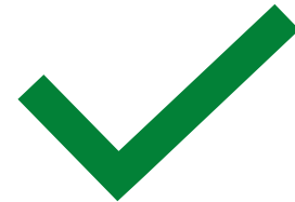
Supported Living including floating support